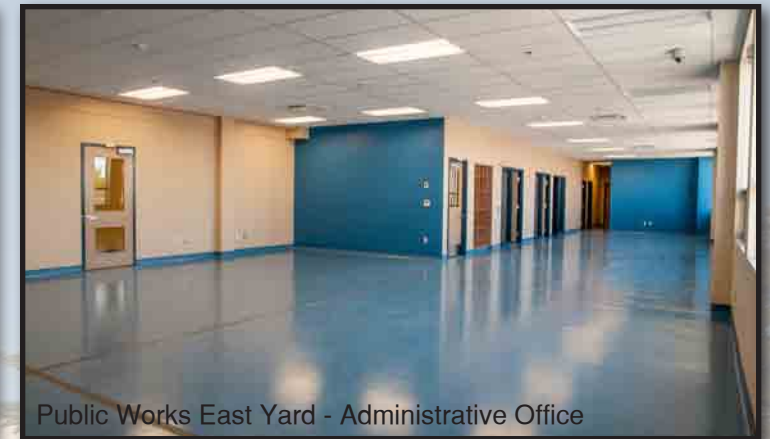
Public Works East Yard - Administrative Office