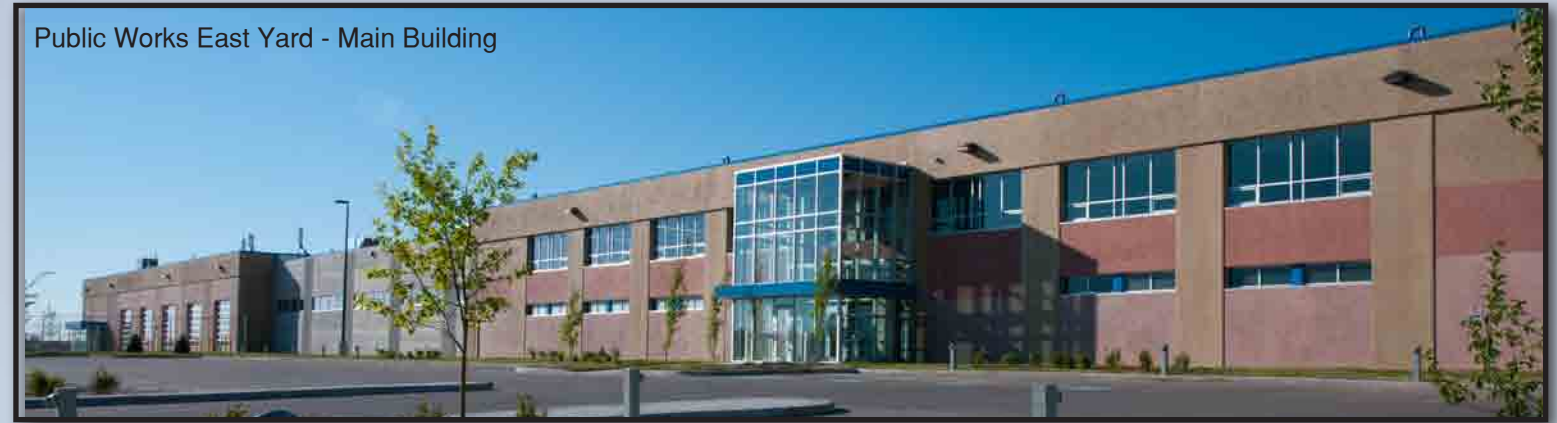
Public Works East Yard - Main Building

Terracon Development Ltd. and Ernst Hansch Construction Ltd. began working on the project design in February 2012, with construction beginning the spring of 2012. This joint-venture had to coordinate and contract eight design consultants and over 50 trades to complete the project. Substantial completion was done in the fall of 2012 and in June 2013 the project was completed and finished three months ahead of schedule.