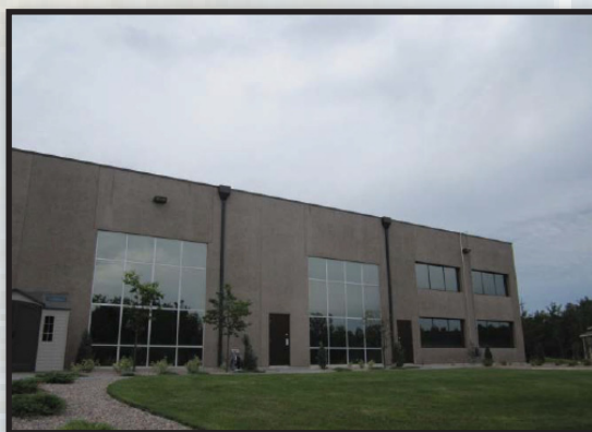
Loading with Glass Panels