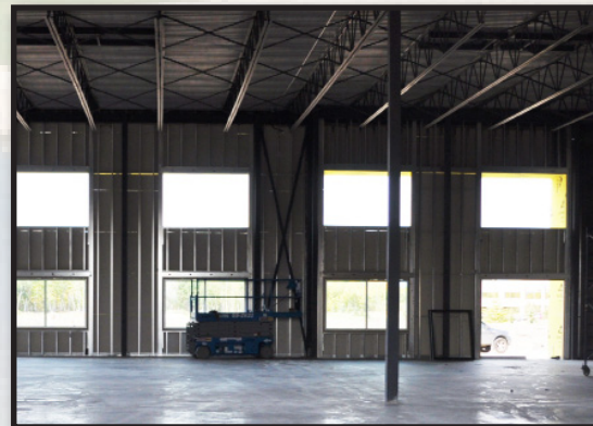
Base Building Interior