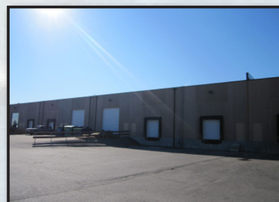
Loading Area with Doors